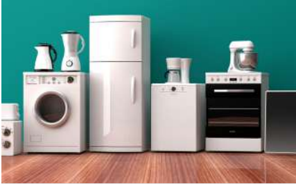
PAT (Electrical Equipment) Testing