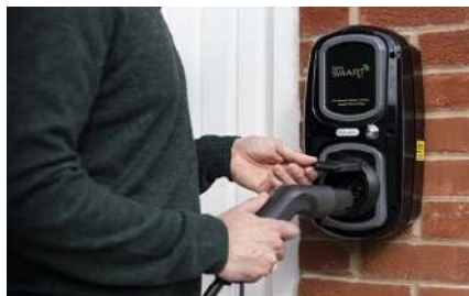
Electric car charging at home – installation and maintenance of EV points