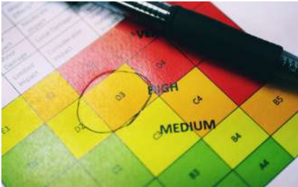
Fire Risk Assessments