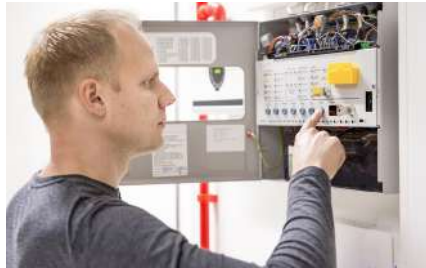
Fire Alarm Testing and Servicing