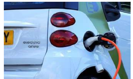
Electric car charging point grants available and the criteria – EVHS and WCS

Hawkesworth (Hawkesworth Appliance Testing Ltd.)