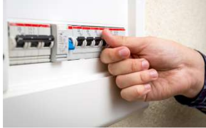
EICR (Fixed Wire Testing)