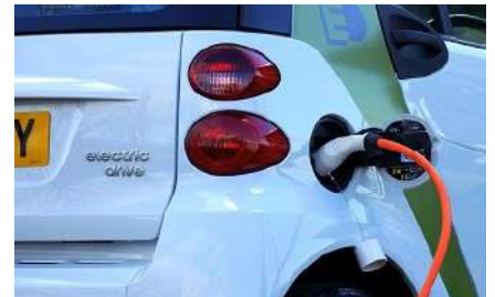
Electric car charging point grants available and the criteria – EVHS and WCS

Hawkesworth (Hawkesworth Appliance Testing Ltd.) Guidance House | York Road | Thirsk | North Yorkshire | YO7 3BT | 01845 524498 | www.hawkesworthappliance-testing.co.uk | enquiries@hawktest.co.uk